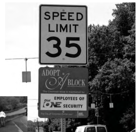
Dial One employees (left) clean up the intersection of Duck Creek and Red Bank Road. Dial One's Adopt-A-Block signage (above).